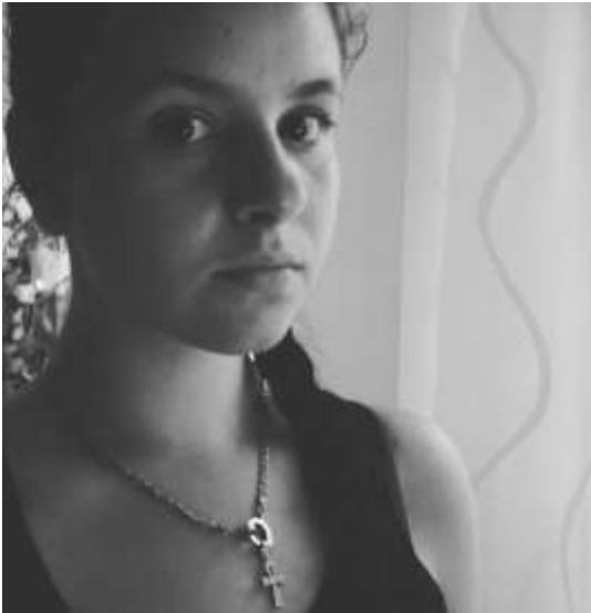
Drawn by Kinga Tóth 10/B